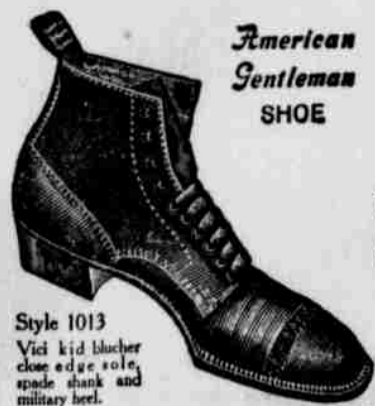
American Gentleman SHOE