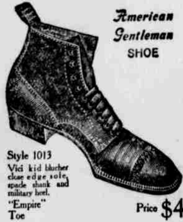
American Gentleman SHOE