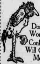
Don't Worry! Conkey Will Cure Me

Special Prices on Stock Foods and Laying Tonics