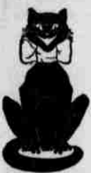
Black Cat Brand Chicago-Kenosha Hose Company Kenosha, Wis.

ARE BETTER BECAUSE THEY WEAR LONGER. THEY ARE ABSOLUTELY FAST COLORS. THEY COST NO MORE THAN OTHER STANDARD BRANDS OF HOSE. BUY HOSE, NOT COUPONS, OR PREMIUMS AND YOU WILL GET BETTER HOSE SATISFACTION, JUST TRY IT AND SEE FOR YOURSELF. PRICES, 2 FOR 25c., 25c., 35c. AND 50c. PAIR. WE ALSO HAVE IN STOCK A COMPLETE LINE OF SILK FIBER HOSE, 25c., 35c. AND 50c. PER PAIR IN ALL THE STAPLE COLORS.