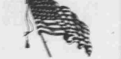
The way to build up Dallas is to give Dallas people.

Subscription Rates: One Year $1.50 Six Months .75 Three Months .40 Strictly in advance.