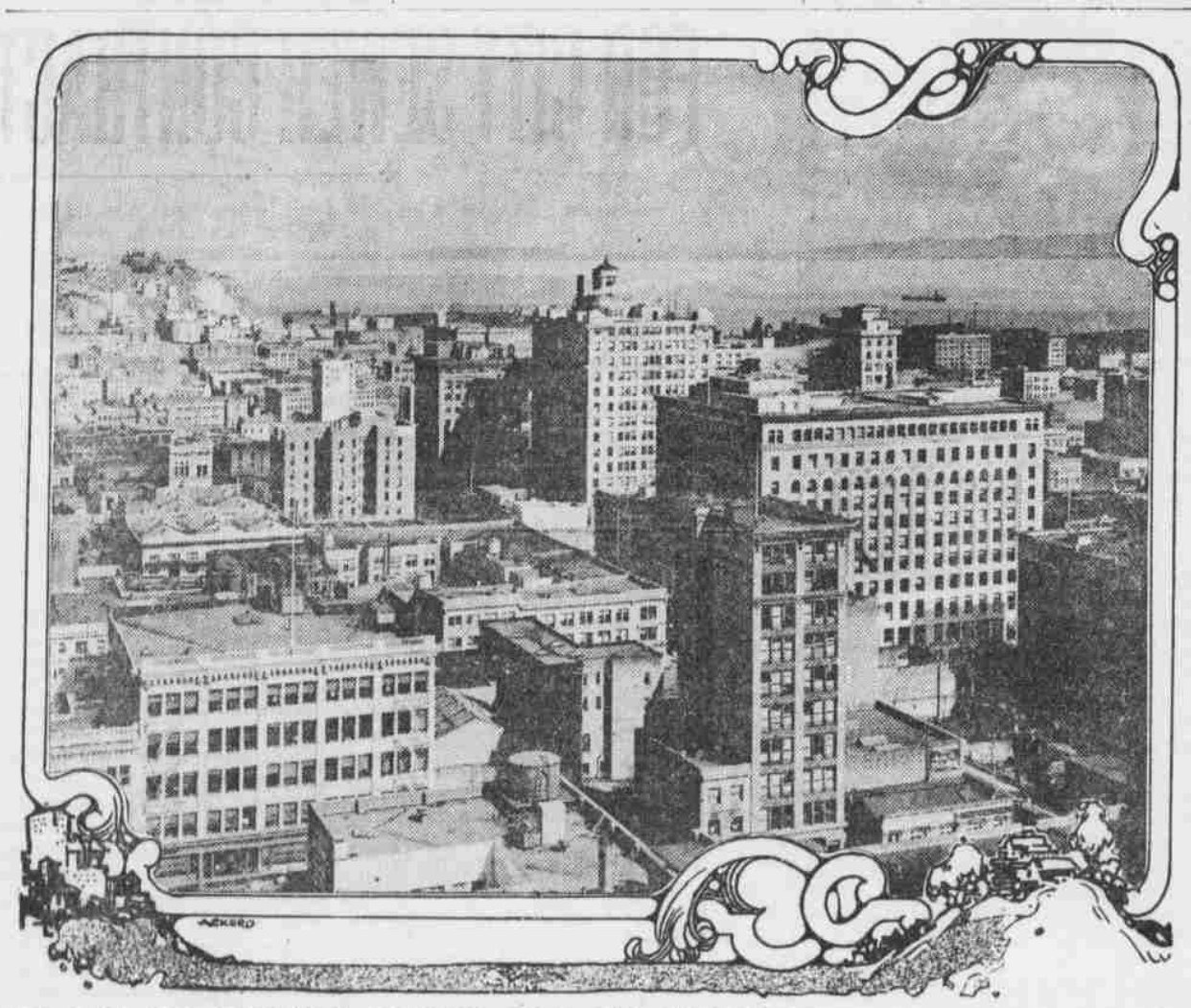
THE NEW SAN FRANCISCO, LOOKING OVER THE CITY TO THE HARBOR, PANAMA-PACIFIC INTERNATIONAL EXPOSITION IN 1915.

The proclamation of the president issued by authority of congress, has been delivered through the instrumentality of the department of state to every quarter of the globe. Inquiries as to the exposition are pouring in upon the exposition management from all