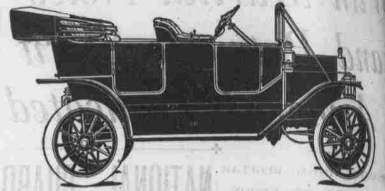
5-PASSENGER TOURING CAR $785 Completely Equipped