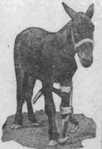
MULE WITH SIX HOOFS.

It is Normal in Every Way Except as to Its Feet. This pig legged mule is normal in every way except as to its feet. It has six hoofs, no two of which are alike, and is compelled to walk with the aid of a wooden leg because of the exceptional malformation of its left fore foot. This foot tapers to a