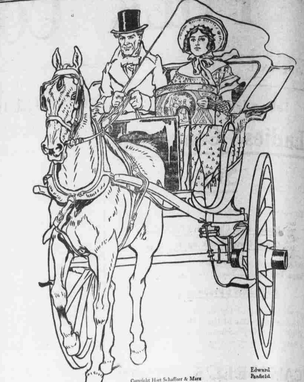
Edward Penfield

YOU see here a reproduction of Edward Penfield's beautiful poster, used to announce THE STYLE BOOK, Hart Schaffner & Marx authoritative guide to correct style in men's clothes. Whenever these best of clothes-makers do anything—posters or clothes—they do it right.