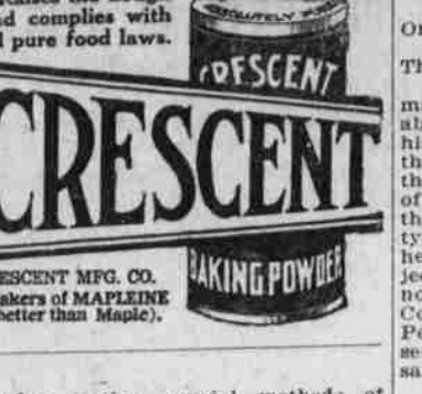
CRESCENT BAKING POWDER. RAISES THE DOUGH AND COMPLEXES WITH ALL PURE FOOD LAWS.

As mercury will surely destroy the sense of smell and completely derange the whole system when entering it through the mucous surfaces. Such articles should never be used except on prescriptions from reputable physicians, as the damage they will do is ten fold to the good you can possibly derive from them. Hall's Catarrh Cure, manufactured by F. J. Cheney & Co., Toledo, O., contains no mercury, and is taken internally, acting directly upon the blood and mucous surfaces of the system. In buying Hall's Catarrh Cure be sure you get the genuine. It is taken internally and made in Toledo, Ohio, by F. J. Cheney & Co. Testimonials free. Sold by druggists. Price, 75c per bottle.