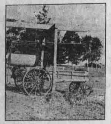
LOADING A MANURE SPREADER.

Manure Spreader is a Conservator of the Farmer's Time and Money. Any machine that saves time or bank account in a commercial house or bank. Any business man will listen to a proposition to buy an appliance that saves time, as time is money, because help costs money. If the machine makes work lighter, does it better than the old way, there is a double argument for owning it. The manure spreader does for the farmer what the letterpress accomplishes for the merchant, and still it is not properly appreciated, says the American Cultivator. A little gunpoint is required to learn to operate one, and many who own spreaders have not given sufficient attention to acquiring the knack of running them so that they are well liked and used as much as should be the case. Most persons have never considered the saving made by this machine. It will distribute a load of manure, coarse or fine, in three to five minutes. Where are the two men who