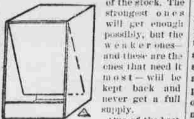
SALT BOX FOR LIVE STOCK.

Some recent experiments tried in France confirmed the idea that stock having a regular supply of salt were more thrifty and made better use of the feed they ate than those deprived of salt for a considerable time. A supply of salt should be kept in every pasture field and be accessible to the animals at all times. The common custom of salting stock once a week is a very poor way to supply the needs of the stock. The strongest ones will get enough possibly, but the weaker ones—and these are the ones that need it most—will be kept back and never get a full supply.