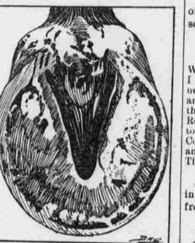
CORNS ON HORSE'S FOOT.

"Among the preventive measures may be mentioned those which serve to maintain the suppleness of the hoof. The dead horn upon the surface of the sole not only retains moisture for a long time, but protects the living horn