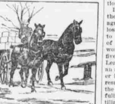
HAULING THE CROP.

It is pertinent also to refer to the trials conducted by the Cornell agricultural station to demonstrate the losses to stable manure when exposed to leaching and weathering. A pile of manure that contained elements worth $5.48 after being exposed for five months was worth only $2.03. Leaving manure in piles in the field is an antiquated method that should never be practiced for the reason that it results in fertilizing the spots where the heaps lie too heavily, giving them fully three times as much of the fertilizing elements as they need, while three times as much ground receives less than it needs or not enough to make a showing. Where manure is allowed to lie in heaps on a field for a few weeks or a month it is an impossibility to spread it so as to get an even distribution of organic matter and of the elements of fertility. It is preferable to spread the manure directly from the wagon with a fork, although this is far less messy and to date 35%