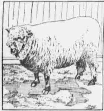
PRIZE SHEPHERD'S RAM.

No matter whether you are making purchases or not, any large breeder will be only too pleased to have you go through his flock. If you are contemplating the founding of a flock or are a new breeder, you will be greatly profited by a visit to the largest and most reputable breeder within your reach, and if you are an old breeder you would enjoy seeing how others do things. Sometimes I think that breeders miss a great deal by not having their efforts more united. More visits with each other would do them