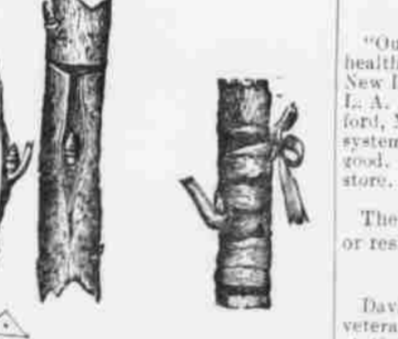
BUD IN POSITION. BUD COMPLETE.

In the spring, after the bud has started to grow, remove the top of the