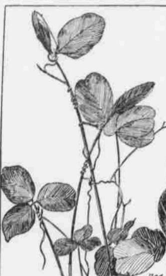
DODDER ON CLOVER PLANT.

Makes It Plain Where the Weed Crop Comes From. The Connecticut experiment station is doing a great work in testing clover seed. It obtained fifty-one samples of the seed just as it is sold by Connecticut seed dealers. These samples were tested for weed seeds and also to see what per cent of the clover seed would sprout. The result of the test shows that only one-sixth of the seed as sold was fit to use. Three samples were adulterated with a worthless plant, and forty-one had more or less dodder, the most dangerous weed or parasite which can get into the crop. Few days pass without a complaint from some one who finds the dodder in his clover. Samples are often sent in showing the clover plants strangled by a pest which twines around them and sucks their life away. The cut shows a mild form of the affliction. Think of putting the seeds of this curse into the ground when you seed your clover! Yet that is just what is being done when we buy ordinary clover seed. In one sample of this Connecticut clover seed 4,411 seeds of the dodder