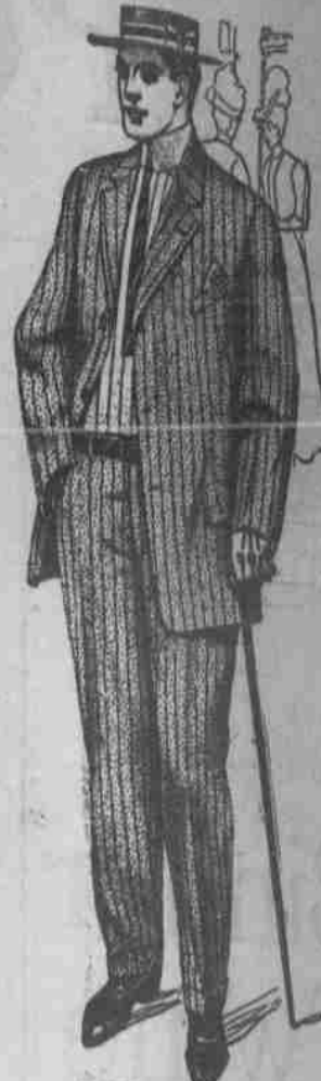
MICHAEL-BERN FINE CLOTHING