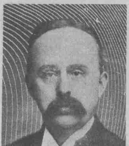
CANDIDATE FOR STATE PRINTER at Republican Primary, April 20, 1906.

Criticism has for years been directed SPECIAL SALE at the same time constructing each year many miles of good, improved at the State Printing Office and it Three little rules we all should keep, nodern roads, and decreasing the tax seems that it still continues. The To make life happy and bright, "Being neither President, Cashier nor office with political bosses, and of a Belt & Cherrington.