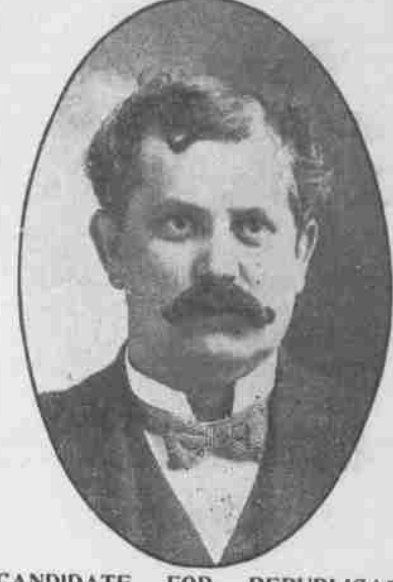
CANDIDATE FOR REPUBLICAN NOMINATION AS STATE TREASURER

where he has since resided. He has $58,000 of expenses which the State -Portland Labor Press. been elected as Mayor, City Recorder Printer does not get. the indebtedness of over $200,000 and run it. at the same time constructing each