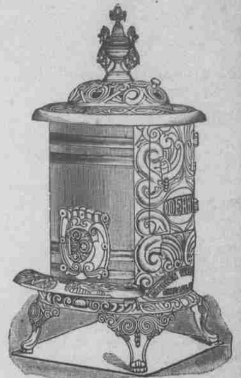
NO. 122 DERBY $12

Prices and quality to suit all and everyone guaranteed.