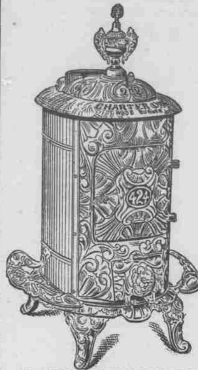
21-INCH CHARTER OAK, $10

It has always been our ambition to have the best line of heaters in Dallas. We now have it—receiving to date one-half carload of Heaters, over twenty different styles and sizes.