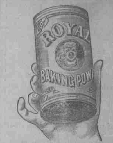
Absolutely Pure THERE IS NO SUBSTITUTE

28 and he is anxious to give the city this WANT LOCAL OPTION LAW