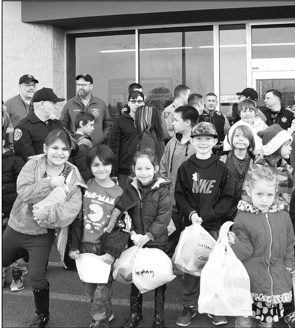
Children from Falls City and Grand Ronde get ready to pose for a group photo with Polk County Sheriff's deputies and Grand Ronde Tribal Police officers on Saturday at the Dallas Walmart. The annual Shop with the Sheriff event purchased gifts for 32 children.

Display at the Polk County Fair, or entered into the open class youth division.