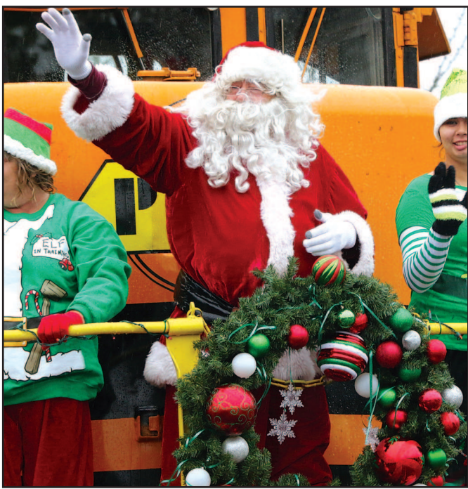
Santa waves to the crowd in Independence as he arrives on the Santa Train on Saturday afternoon.