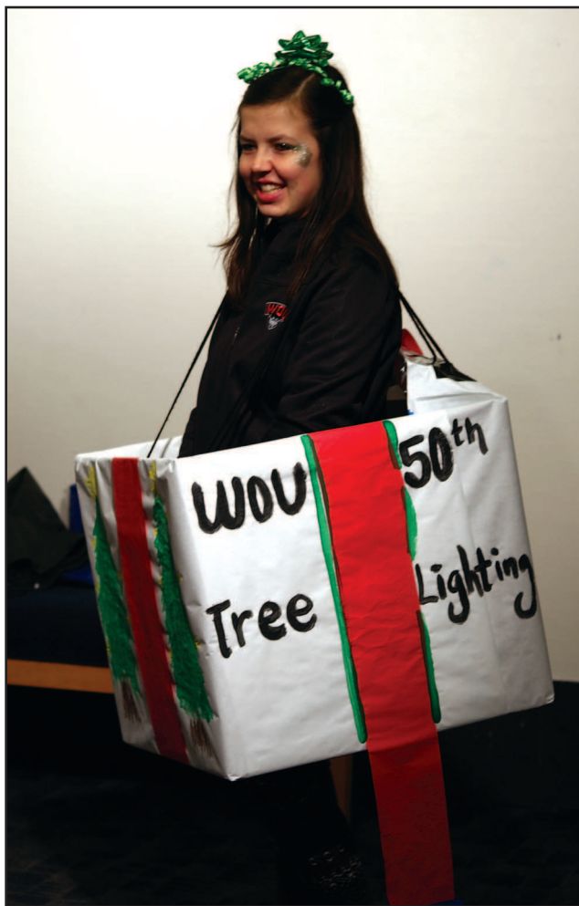
Western Oregon University celebrated the 50th anniversary of its tree lighting on Friday.