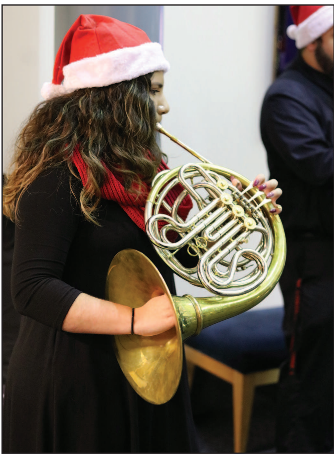
Western Oregon University's 50th tree lighting ceremony had music, snacks, a light parade and a visit from Santa Claus on Friday evening.