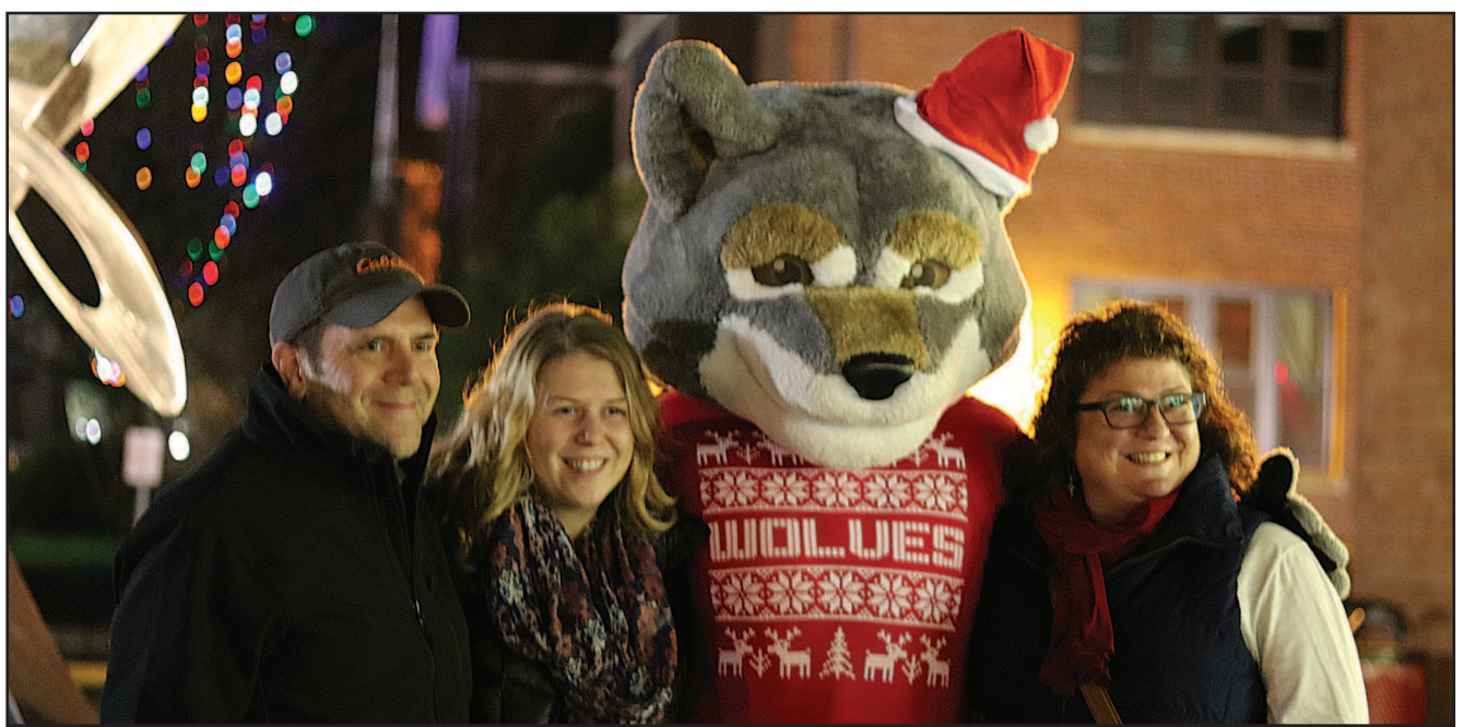
Wolfie poses for a photo during the tree lighting ceremony on Friday night.