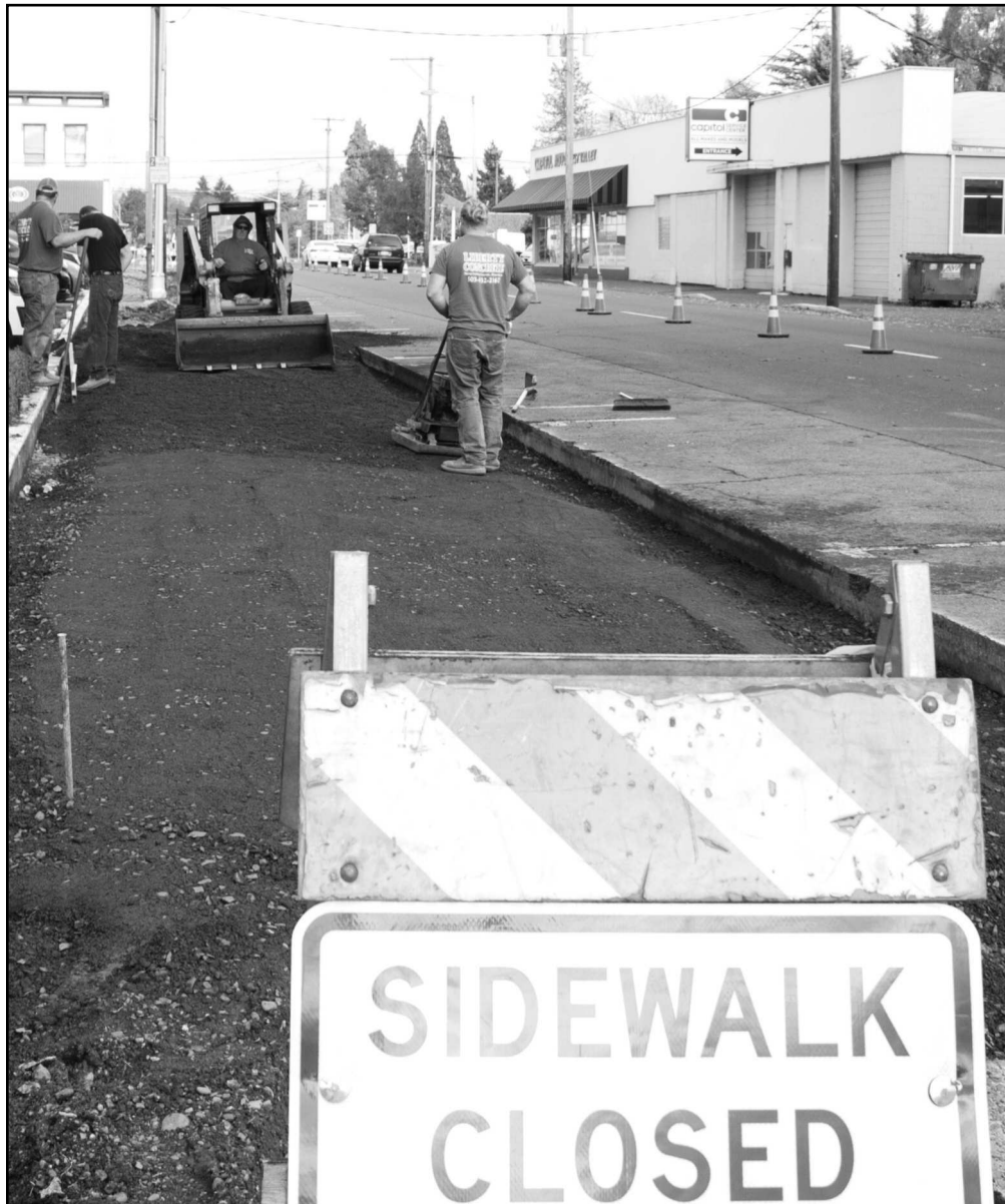
A Liberty Concrete crew prepares the sidewalk for paving on Jefferson Street by the Polk County Courthouse. The project is part of a Dallas Urban Renewal "streetscape." Polk County will repave the Court and Mill streets sidewalks on the courthouse square.