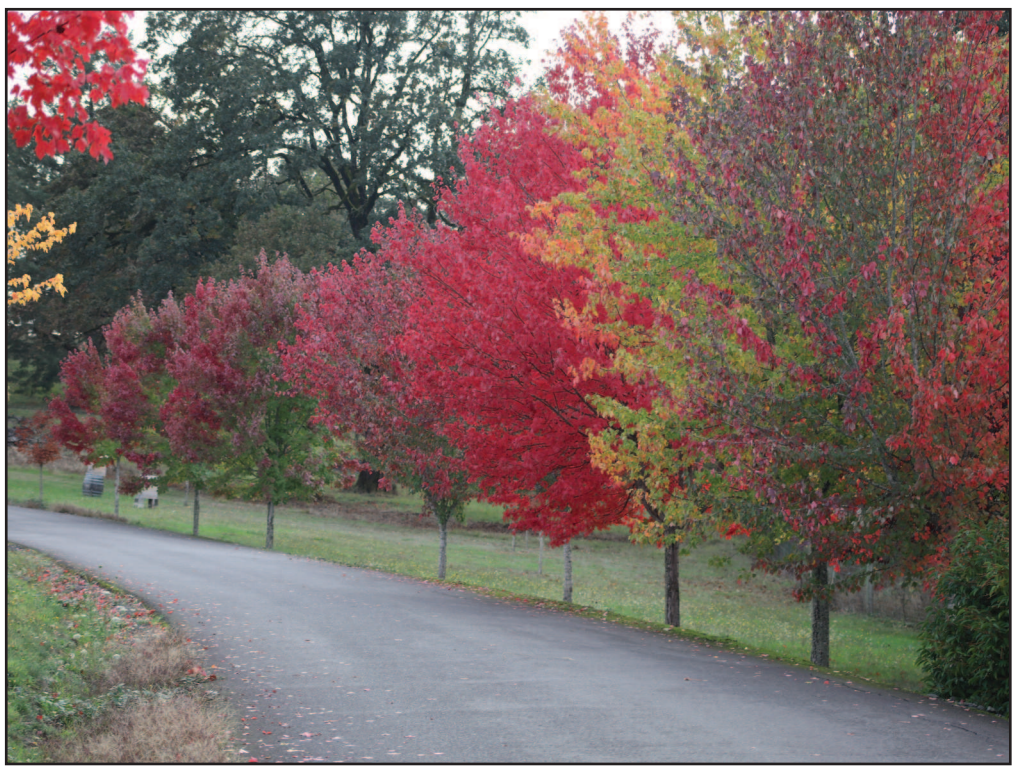
The fall colors are on full display throughout Polk County.