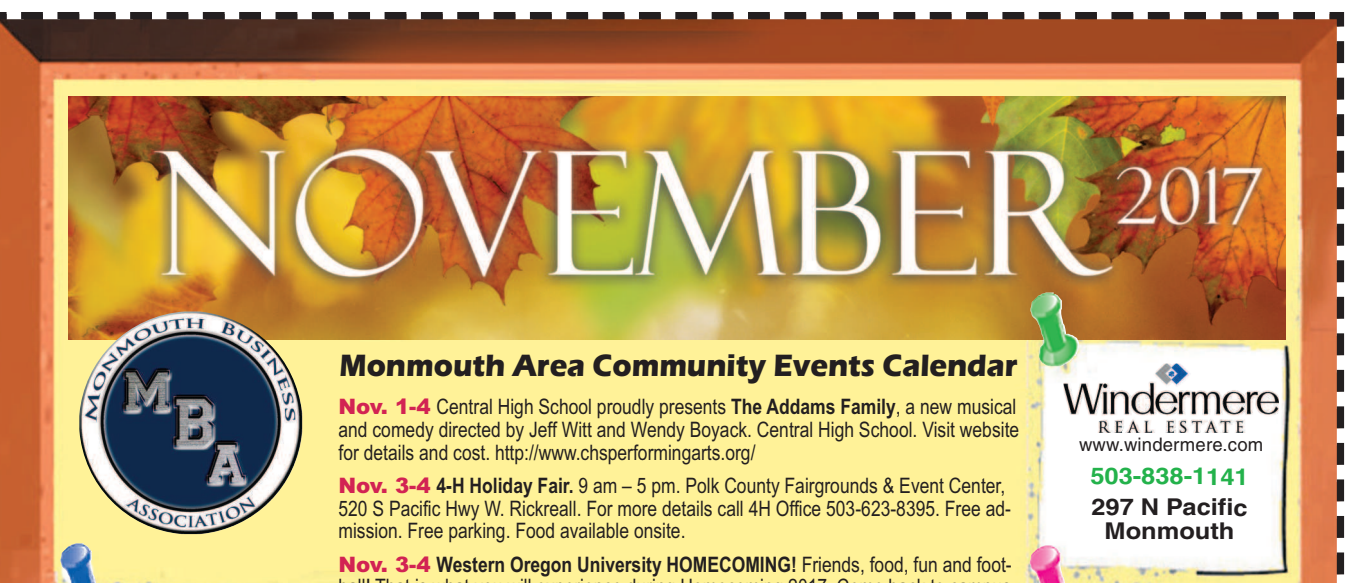
The Polk County Itemizer-Observer <u>YOUR</u> Community News Source!

ished, after a NW Natural expansion project required tearing up part of the street and sidewalk.