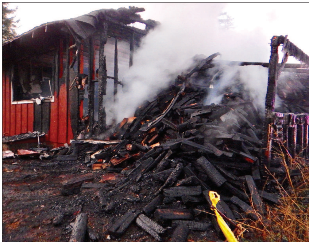
A house fire on Rueben Boise Road on Oct. 24 left the home with heavy smoke and fire damage, and two residents displaced.