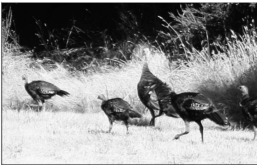
A flock of wild turkeys roams the grounds of Oakdale Elementary School on Friday.