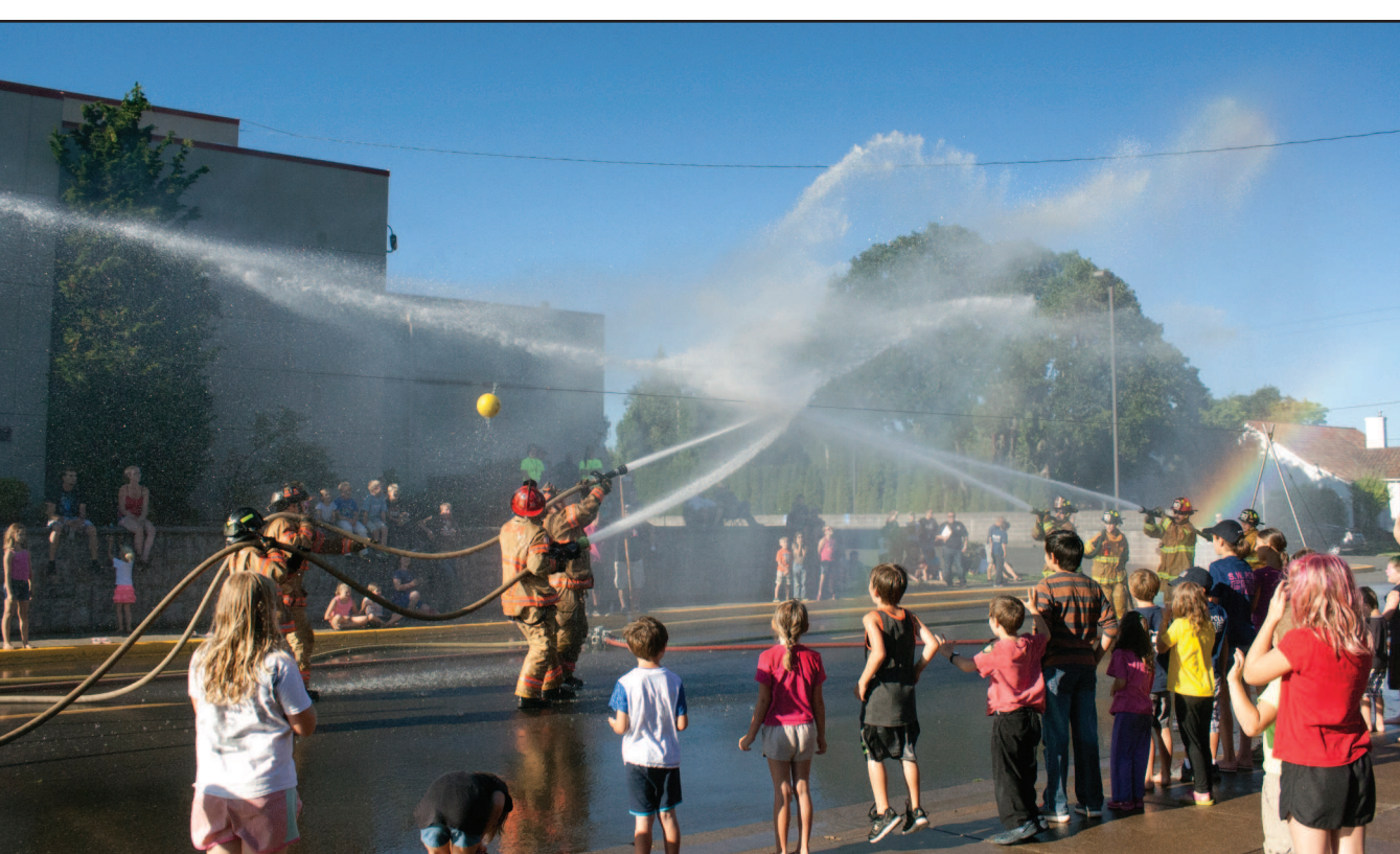
Teams of firefighters battled it out in the soaking, but not-so-serious sport of waterball at the Dallas Fire Station on Friday night. The weather was just warm enough for the audience to want to stand in the "spray zone."