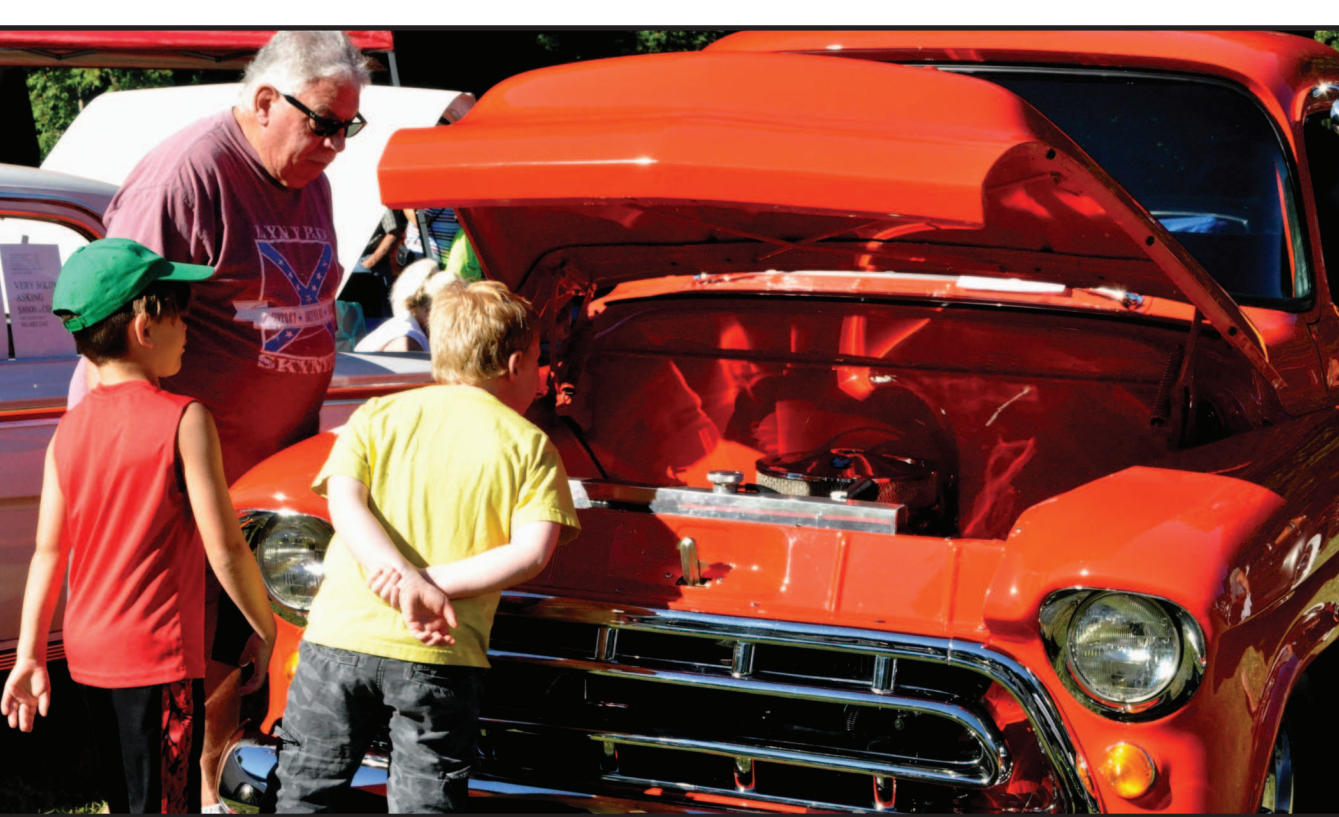
Residents of all ages came to inspect the fine craftsmanship of classic and modern automobiles, alike, at the Tom Newton Memorial Car Show on Sunday morning.