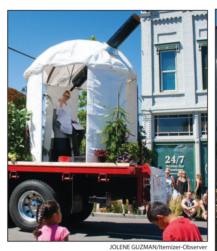
Van Well Building Supply's Summerfest parade entry was all about the Aug. 21 Great American Eclipse. For parade results, to www.polkio.com