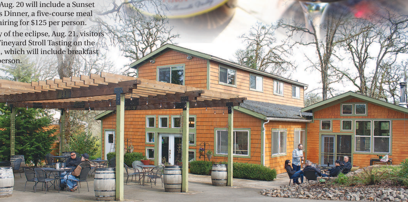
A visit to Left Coast is an experience not to be missed.

Tasting Room 503-831-4916 • www.leftcoastcellars.com 4225 N Pacific Hwy 99W, Rickreall