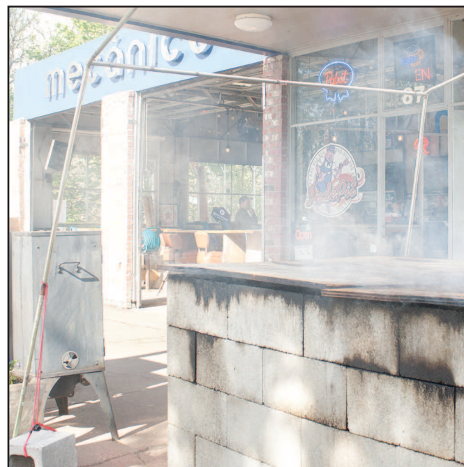
The pit at IndePit is busy cooking a brisket on Friday.