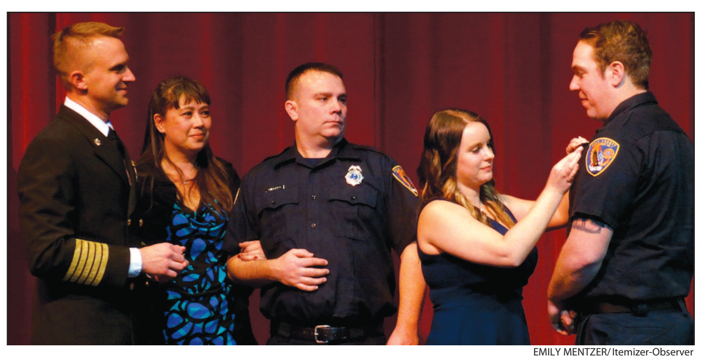
The ceremony featured four career firefighter/paramedics, five volunteer firefighters, four lieutenants and one captain.

For more information about Polk County Fire District No. 1: www.polknol.org/.