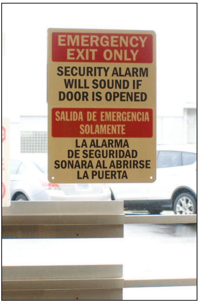
The commissioners would like to see a similar system on the old courthouse doors as is in the newer part of the building.