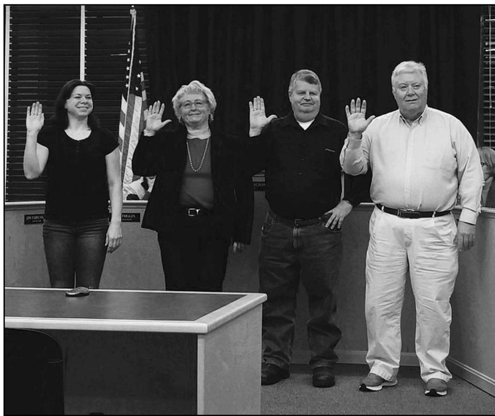
Dallas' new city councilors were sworn in during the Jan. 3 meeting.

The charter also states: "Whenever the mayor is unable to perform the func-