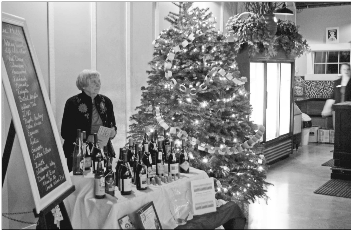
NATASCHA CRONIN/for the Itemizer-Observer

"They'll put on their superhero cape, because