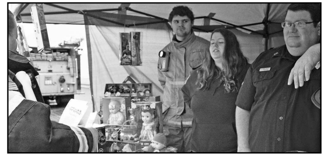
Falls City’s fire department volunteers work during its 2015 toy drive.

• Donations for Toys for Tots (toys and financial donations) can be dropped off at Fee Mail Depot, 169 S. Broad St. in Monmouth. Hours are Monday through Friday 10 a.m. to 6 p.m. Donation also can be made at www.toysfortots.org . To ensure donations go to Polk County children, select Oregon, then Polk County. • Toy donations can be made at a several businesses and organizations in Polk County. For more information: 503-917-9181 or toysfortotspolk@gmail.com . • Monmouth-Independence Christmas Project needs adopters for families in need. For more information: 503-339-4955. Spanish: 971-388-3328.