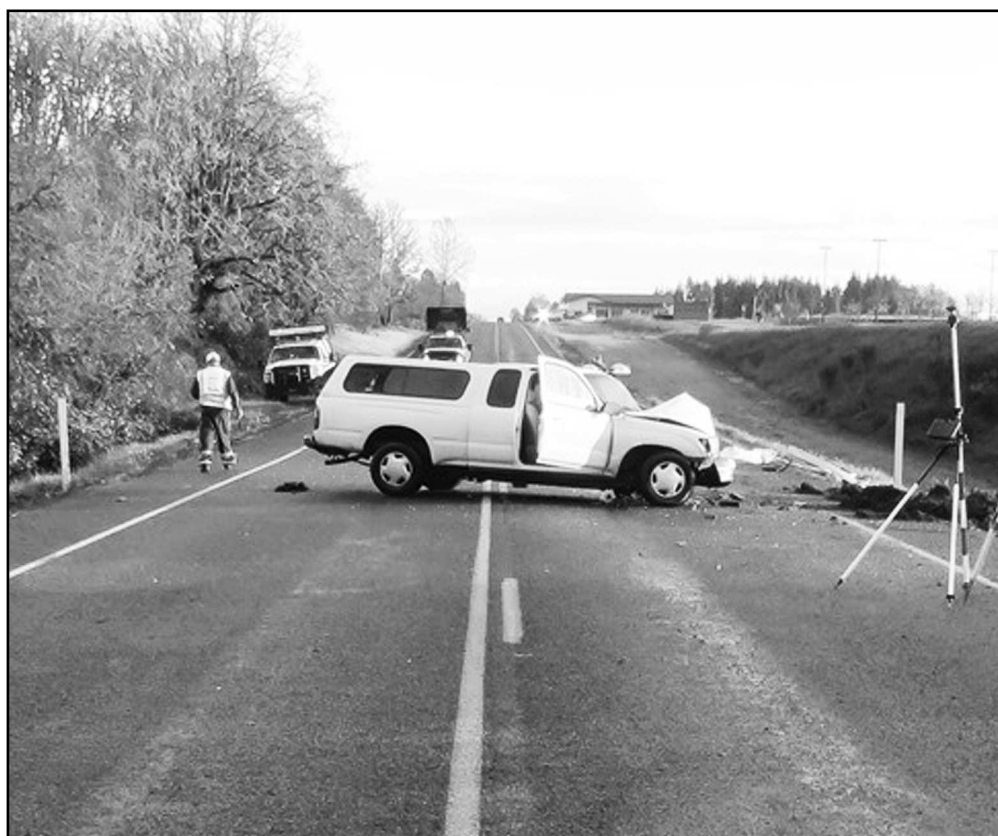
Investigators work to clear the scene of a fatal accident on Kings Valley Highway in Dallas on Nov. 16. A Dallas man was killed in the crash.

The truck left the roadway where it came to rest in the ditch.