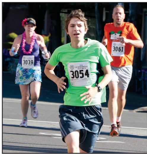
A trio of runners sprints toward the finish line at the Summerfest Fun Run Saturday.