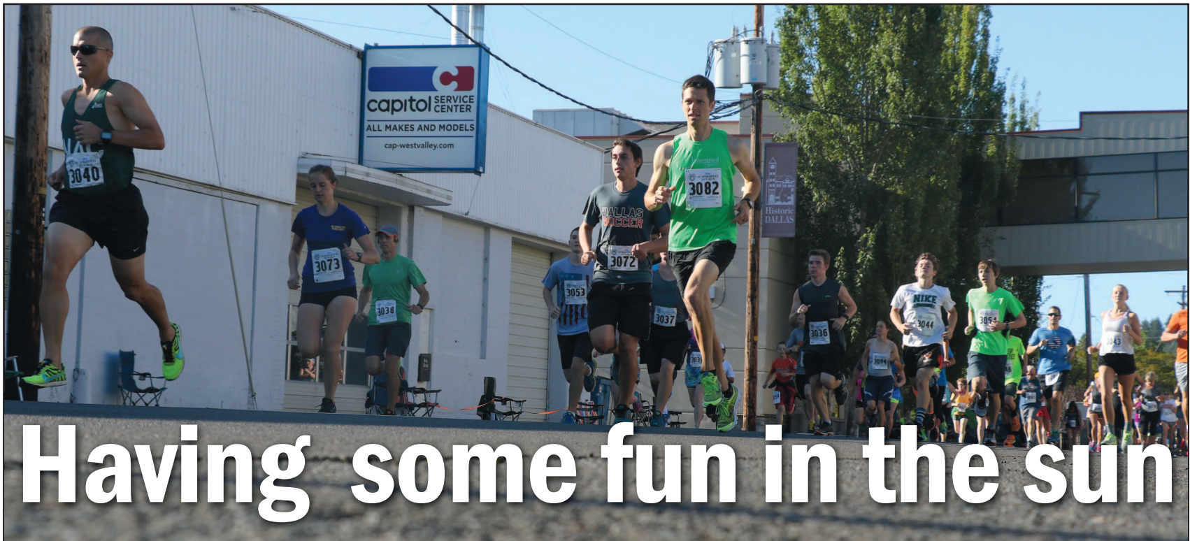
Racers take off at the start of the Summerfest Fun Run on Saturday morning. Runners and walkers took part in the 5-kilometer race.

Cost is $75 each or $300 per team and includes dinner. Money raised will help create championship experiences for student-athletes. For more information: 503-838-8449.