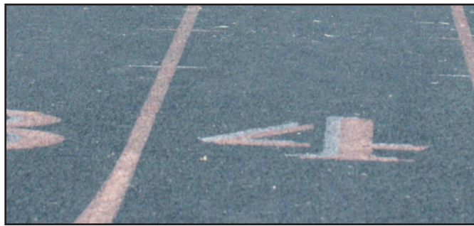
The track at Dallas High School was installed in 2004