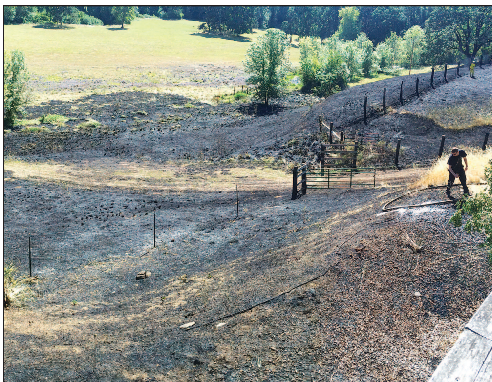
A field fire burned five acres and caused two people to be evacuated on Saturday, but due to a quick response from firefighters, there was no major damages or injuries.