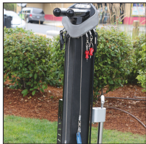
Two bike repair stations were installed at Riverview Park in Independence.