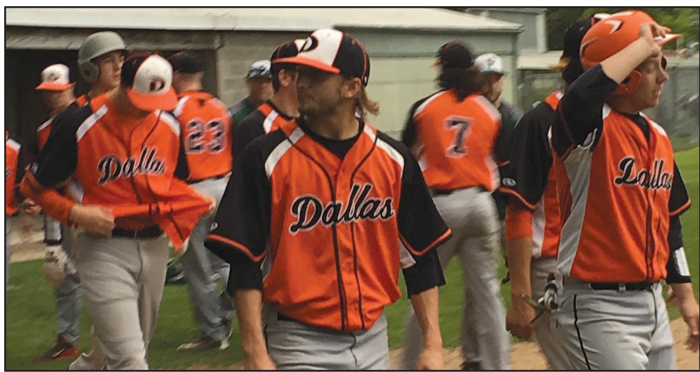
Dallas' baseball team leaves the field after losing to Putnam 6-0 on May 25.