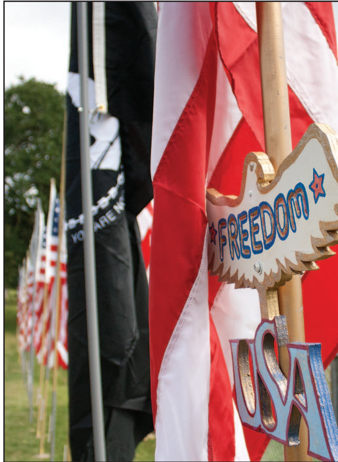
Top: Oregon Army National Guard soldiers helped put up the Avenue of Flags display in Dallas Cemetery Thursday. Monday, the American Legion held the hour-long ceremony honoring those who served our country. Other events marking Memorial Day were held in Independence, Grand Ronde and at Western Oregon University. Center: Names of the fallen are displayed on the nearly 700 flags lining the roads through Dallas Cemetery. Right: The first flag of the display has a patriotic sign affixed to it. The second flag honors POWs.