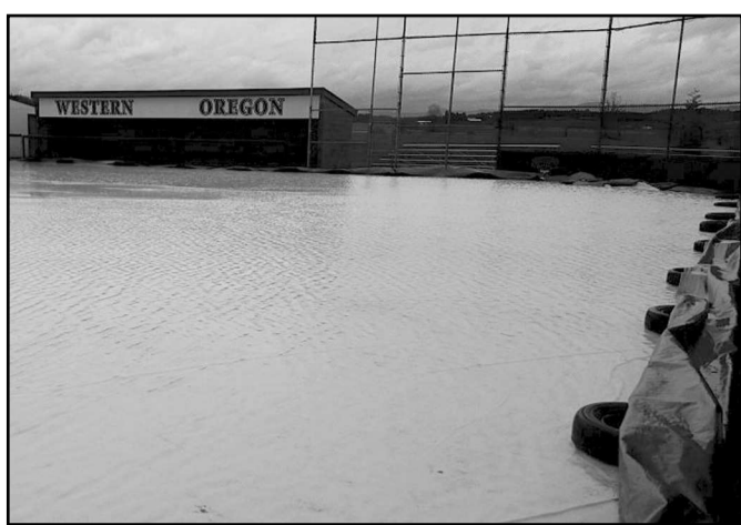
The rainy weather has made Western Oregon's softball field unplayable. WOU has yet to have a home game.