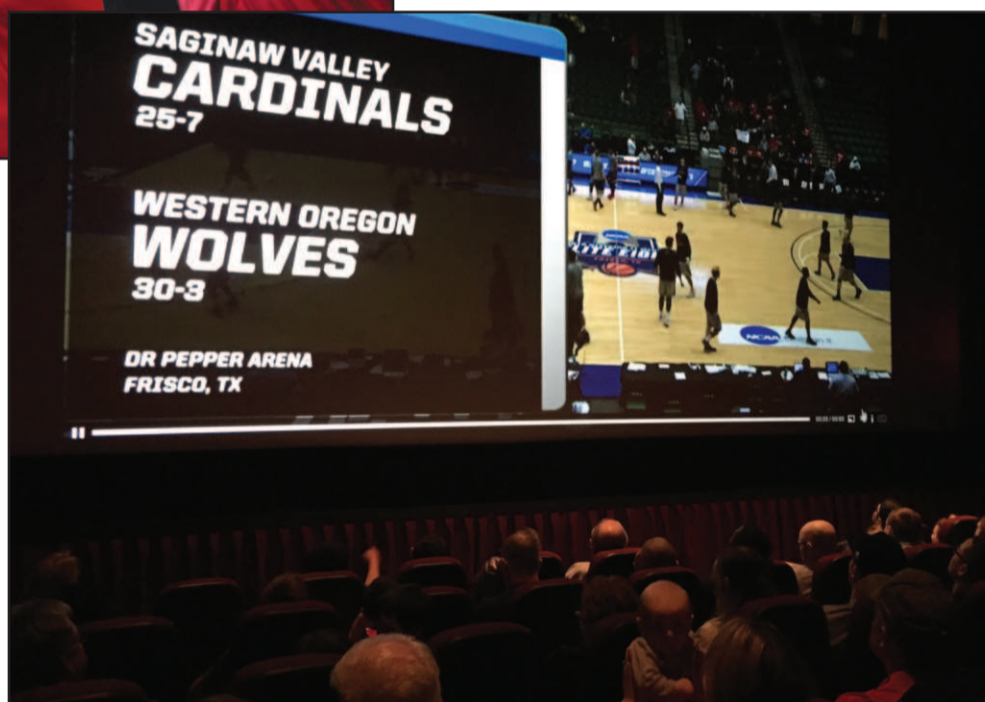
Right: Fans await the start of WOU's Elite Eight matchup with Saginaw Valley State on March 23. Western Oregon held a watch party at Independence Cinema, giving fans a chance to check out the game on the ultimate big screen. The theater was sold out.