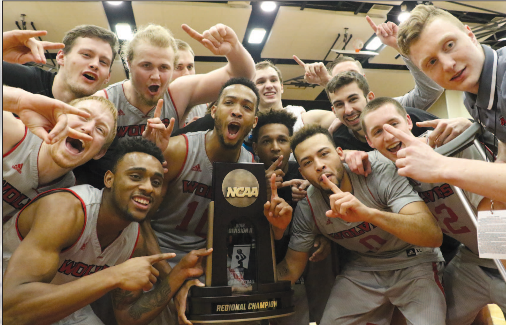
Western Oregon players celebrate after winning the NCAA Division II West Regional title on Monday evening.