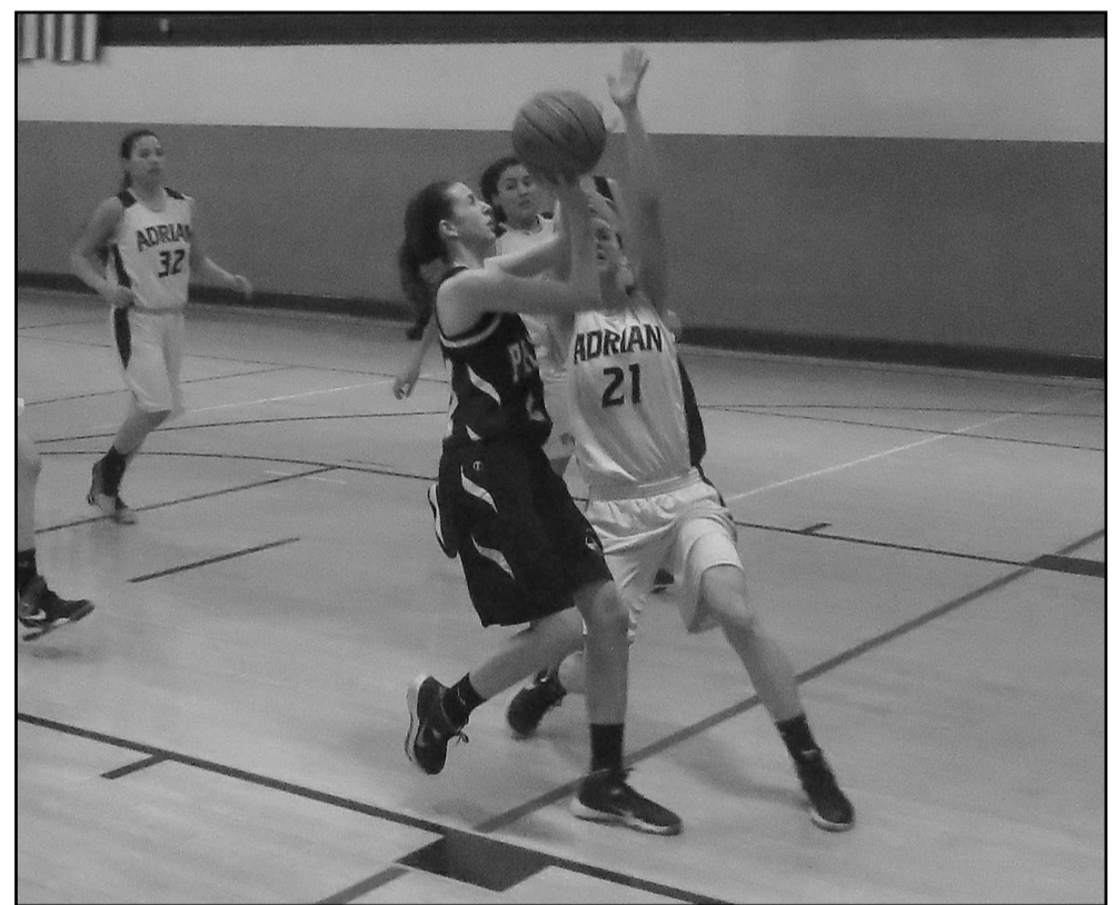
Perrydale's girls basketball team lost to Adrian in the second round of the OSAA Class 1A state playoffs on Friday night.