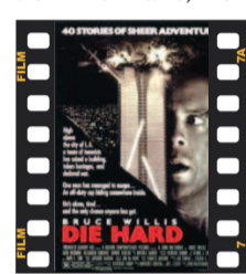
20th Century Fox

1. "Die Hard" (1988, R): OK action flick fans, here's one for you.