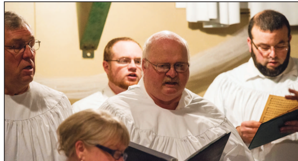
The choir in the 2014 Rickreall Christmas Pageant fills the room with sound during scene changes. The pageant will take the stage for the 75th time with three performances Thursday, Friday and Saturday at the Rickreall Event Hall.

it would be fun," he said. "I know they are always looking for people."