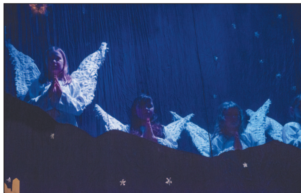
Angels in the 2014 pageant cast fill the night sky above the shepherds in the field in one of the nine scenes in the dramatic retelling of the traditional Christmas story.