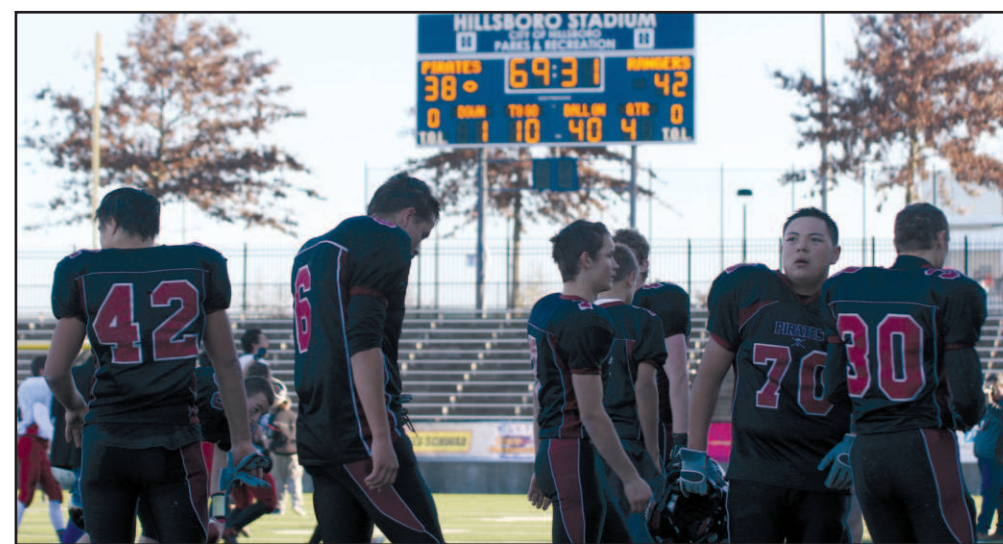
Perrydale players react after losing to Dufur 42-38 in the 1A state semifinals.