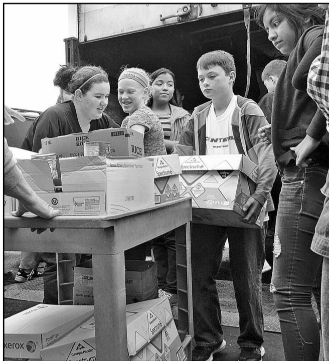
Students help load food boxes collected during a canned-food drive for Ella Curran Food Bank.

Jade Gil spent two and a half hours raking leaves in her neighborhood and