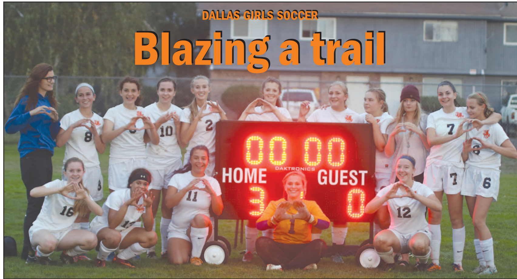
Dallas' girls soccer team celebrates after its 3-0 victory over Springfield in a state play-in match on Thursday afternoon.

55 The number of points per game the Perrydale football averaged during the regular season. The Pirates went 8-0 overall and 6-0 in Special District 4 play. Perrydale hosts Pine Eagle in the first round of the 1A state playoffs on Saturday.