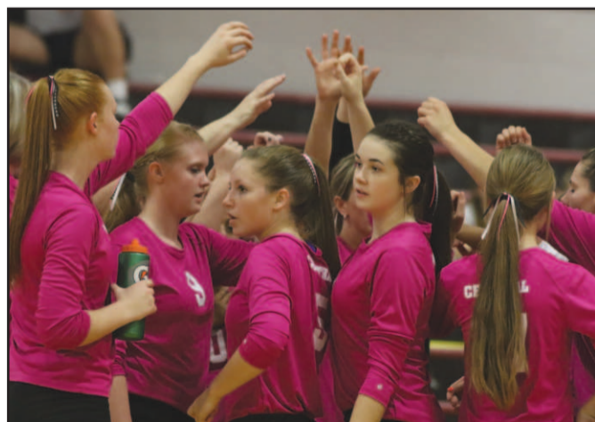
Central breaks out of a timeout during its match against Silverton on Thursday evening at Central High.