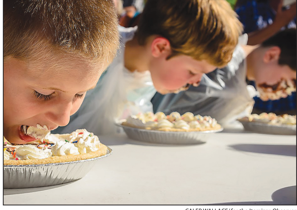
The Hop & Heritage pie eating contest attracted contestants of all ages on Saturday.