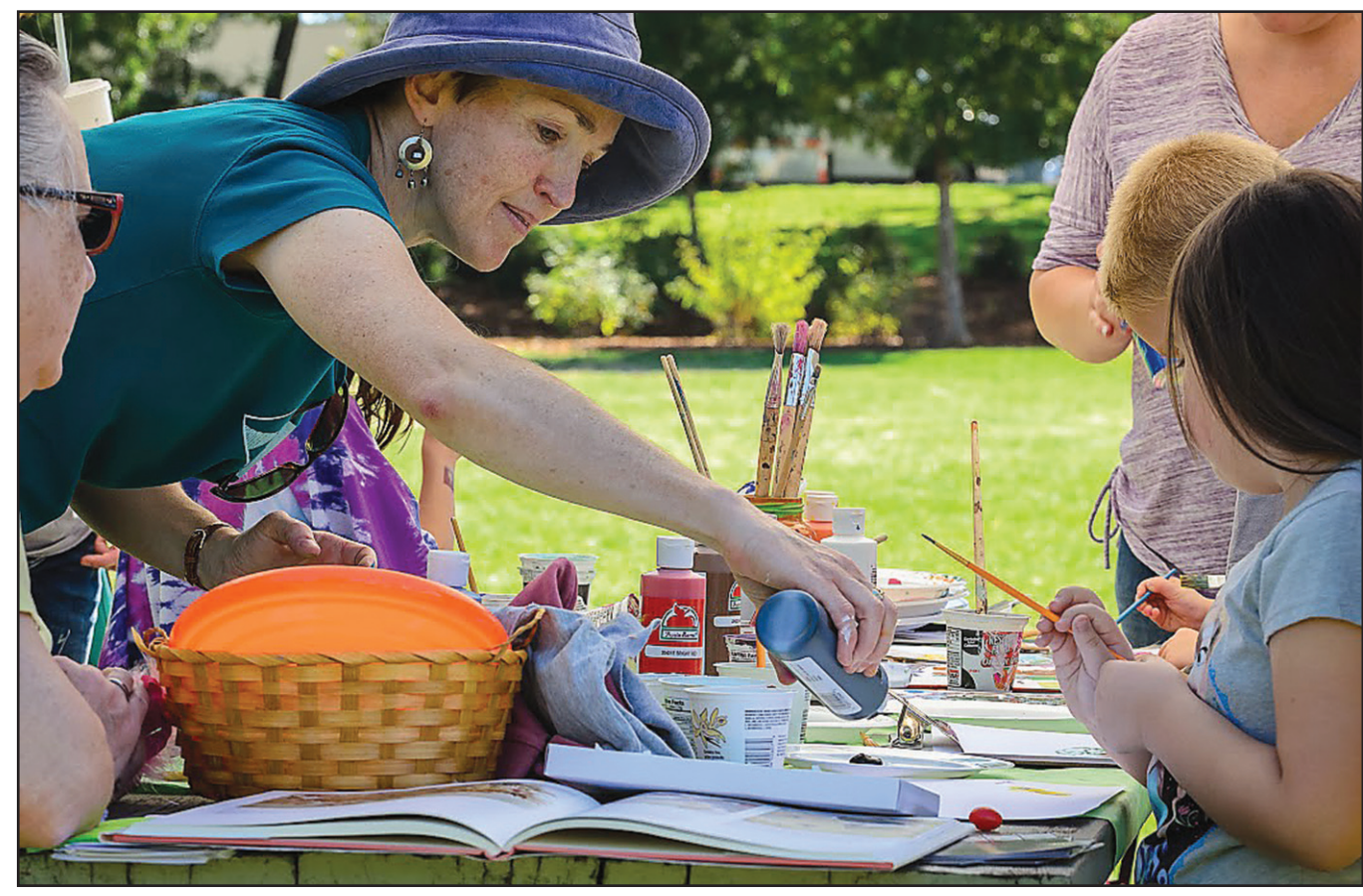
The Hop & Heritage Festival in Independence on Saturday provided activities for attendees of all ages.

The annual Hop & Heritage Festival in Independence took the town back to a time when it was the "hop capital of the world."Festival attendees started the day with pilots cooking their breakfast and watching hot air balloons launch and then headed downtown for some tric fun.