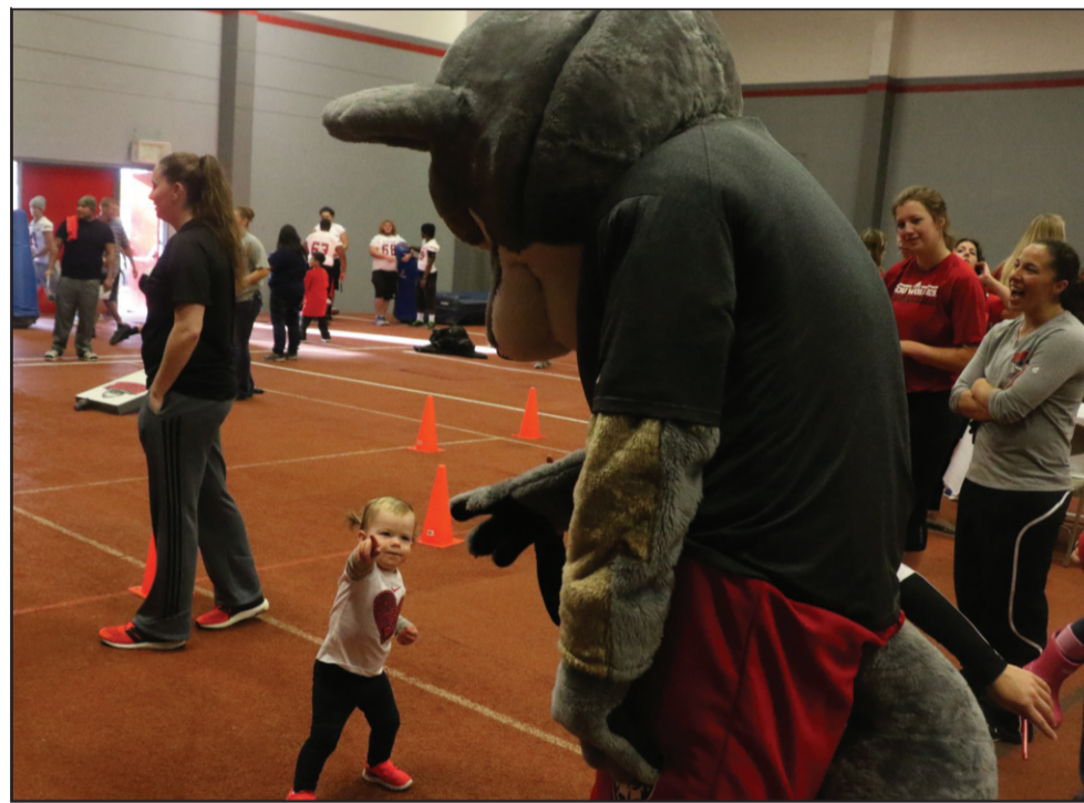
A young Wolves fan points toward Western Oregon mascot Wolfy during Wolves' Fan Fest on Thursday afternoon. Athletes from all WOU teams welcomed fans of all ages with a variety of games and activities.