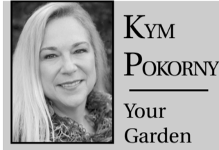
KYM POKORNY Your Garden

What type of garlic should you plant? Some gardeners like to grow top-setting garlic, also called hardneck. Common hardneck types include Korean, Chesnock Red, German Red and Spanish Roja. These varieties produce tiny bulblets at the end of a tall flowering stalk in addition to a fat underground