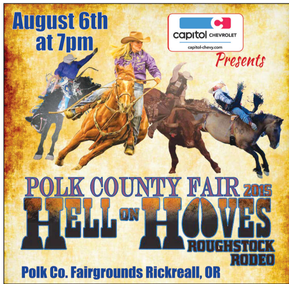
The Roughstock Rodeo Hell on Hooves is free with fair admission Thursday night.

But this year's fair hopes that the triumphant return of the rodeo will lead to